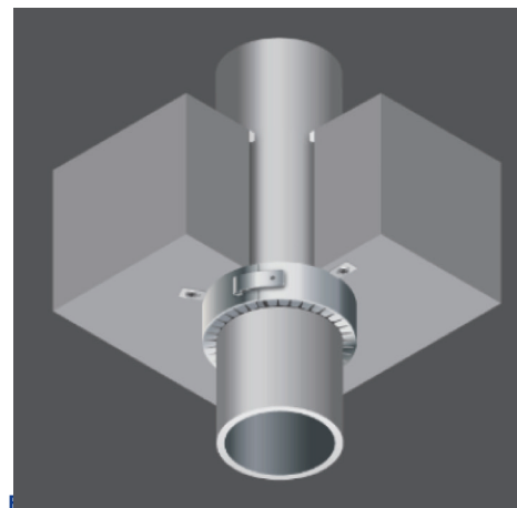
fixed to the underside only of any suitable floor construction

No maintenance required after installation. Routine inspection recommended to ensure no damage.